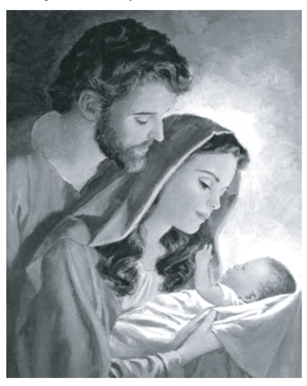
Feast of the Holy Family